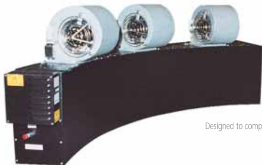
Designed to complement a revolving door