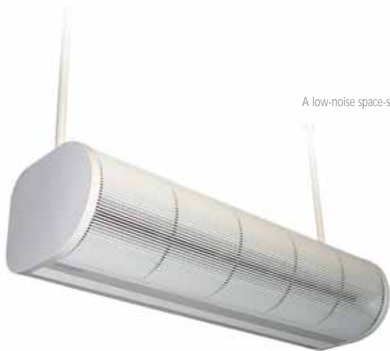
The high capacity Air Barrier for large entrances