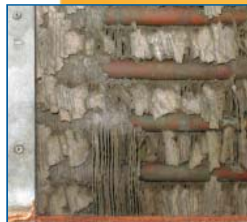
Effects of corrosion.