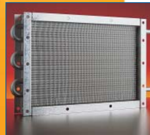
New Blygold Coil